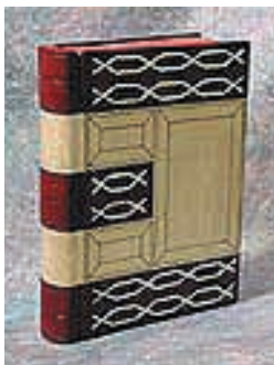
Russia banded stationery binding