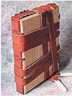
Multi-Quire codex Egypt