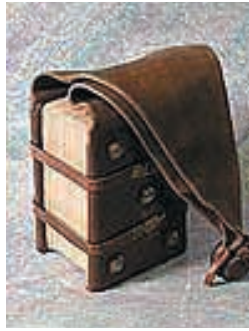
Girdle book Northern Europe