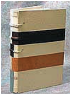
Cut-away printed book 15-20th centuries