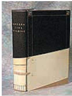
Modern fine binding

action. Unlike real historical bindings, models can be freely manipulated to observe the mobility of the bound structure. Bookbinding models permit direct visual and tactile inspection of combinations of materials and structures.