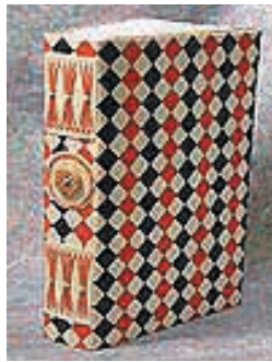
Early account book